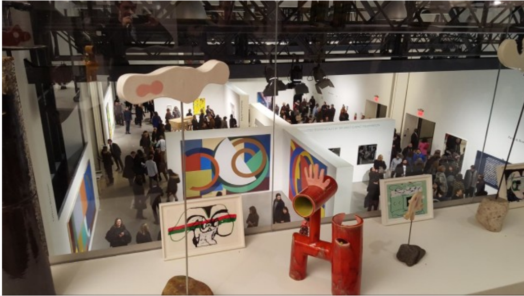
A view of Independent from the non-profit mezzanine perch. Foreground: Gerasimos Floratos at White Columns.

by CHRIS GREEN on MARCH 4, 2016 ART FAIR