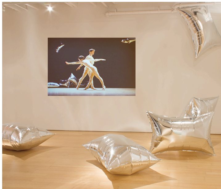
Merce Cunningham’s ‘Rainforest’ (1968) installed with Andy Warhol’s ‘Silver Clouds’

But lumping a group of artists together as “minimalists” ignores how different they are from one another and simplifies the intentions behind their art. Dance makers during this time may have used movement sparingly and without embellishment, but that doesn’t mean they shared the same severity as, say, Donald Judd (and we know how much he rejected the minimalist label). Both Judd and Morris denied that their objects related to architecture, technology, or mathematics; instead, they emphasized their occupation with formal problems, with the “autonomous and literal nature of sculpture,” as Morris put it. Aptly for this show, their approach can be summed up by a statement from Yvonne Rainer: “In the studio, I work with aesthetics like a shoemaker works with leather.”