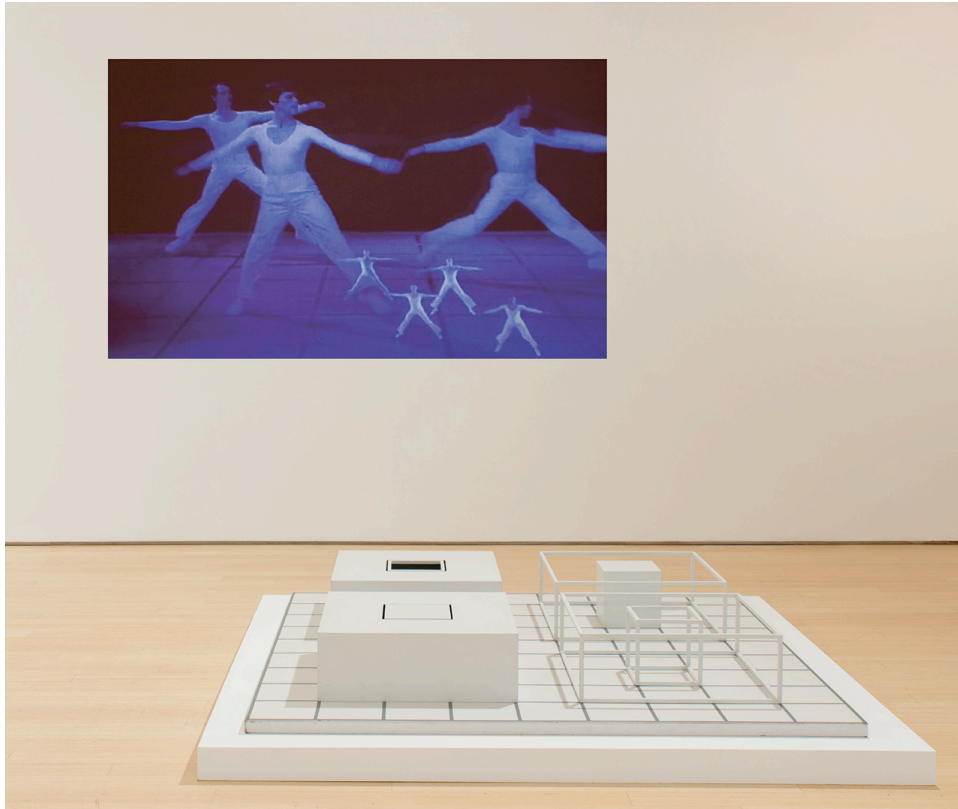
Lucinda Childs's 'Dance' (1979) and Sol LeWitt's "Serial Project ABCD 5" installed at Loretta Howard Gallery

During the summer of 1960, dance artists Simone Forti, Nancy Meehan, and Yvonne Rainer rented rehearsal space at Dance Players on Sixth Avenue so they could improvise together. Sitting in on a rehearsal, the-soon-to-be-sculptor Robert Morris — who was married to Forti at the time — commented that the best moments were when they weren't dancing.