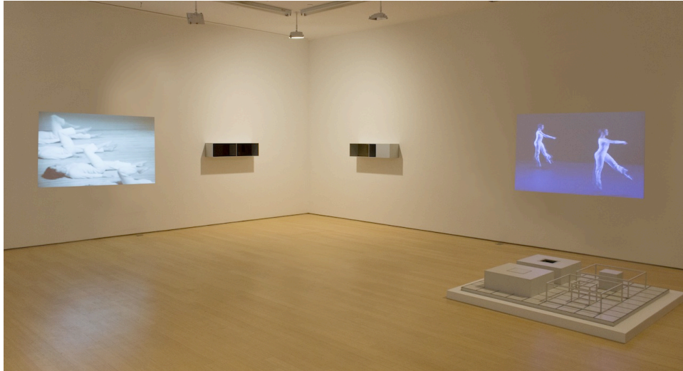
From left to right: Trisha Brown, 'Group Primary Accumulation' (1973); Donald Judd, Menziken boxes "Untitled" (1988) and "Untitled" (1991); Lucinda Childs, 'Dance' (1979); Sol LeWitt, "Serial Project ABCD 5"

that would assume a physical presence without recourse to grand philosophical statements. Brown's Accumulation may take on a more rational impression when viewed next to Dudd's boxes, but the performance evidences an organic spontaneity beyond the minimalist label. Brown and Judd did appreciate each other's aesthetic pursuits; she later asked him to collaborate on sets and costumes.