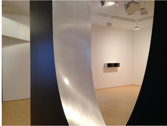
From left to right: Robert Morris, "Corner Beam" (1964); Ronald Bladen, "Cosmic Seed" (1977); Donald Judd, "Untitled (Menziken boxes)" (1988)

Seeing Dance is refreshing. At a time when the majority of performance and visual art is steeped in satire, irony, and a pervasive cult of personalities, this work reminds us of the beauty to be found in layers of unemotional movement, sound, and set. And like Cunningham's Rainforest , it reminds us of the potential brilliance that can arise through collaboration.