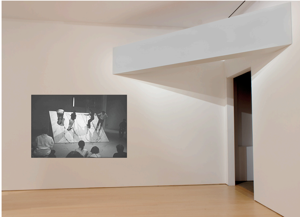
Simone Forti's 'Slant Board' (1961) and Robert Morris's "Corner Beam" (1964)

Matched up with Forti's film is Morris's "Corner Beam" (1964), one of a series of large-scale geometric forms originally created for a solo show at the Green Gallery, in which the artist focused on delineating the gallery space. Reinstalled here, the work is just as successful as must have been then, redefining and reactivating the physical space. Stripped of distractions, details, or metaphorical references — even of surface inflection — its severity assimilates so perfectly to the white box that viewers might miss it entirely. Its bold simplicity is a foil to Forti's athletic Slant Board .